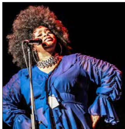
Thee Souliz Band featuring Sugar and Spice showed some attitude in their music, taking the second place trophy in the Band Division back to the Suncoast Blues Society.