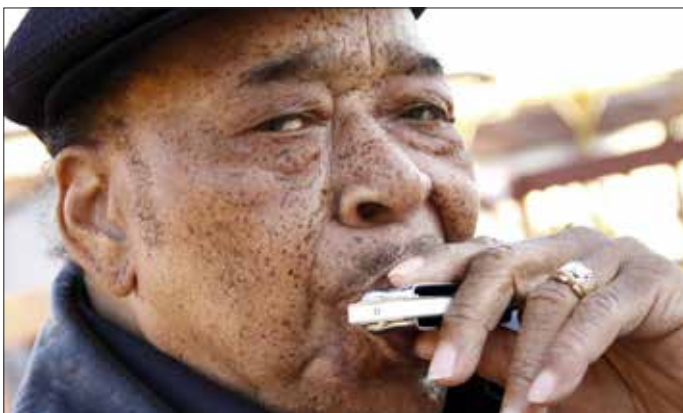
Known as Mr. Superharp for his powerful harmonica playing, James Cotton exemplified the heart and soul of Chicago Blues.